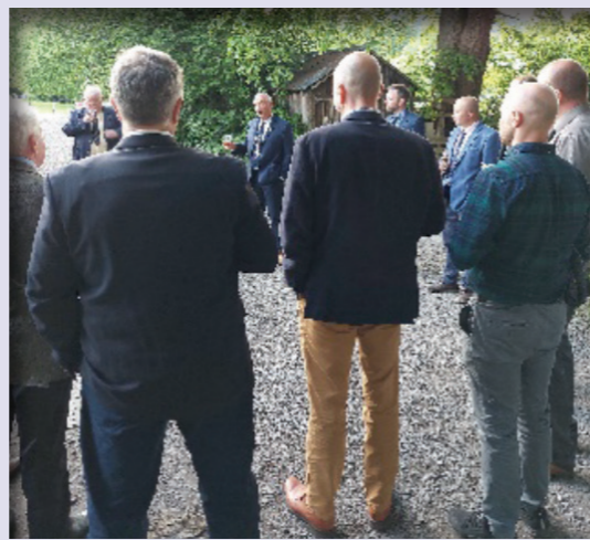
The Lord Dean leads a toast by the banks of the River Tay