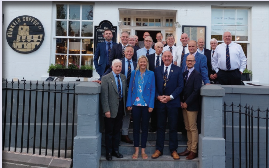
The Lord Dean, Committee of Management, Ale Tasters & Meal Searchers, Ex-Deans and Tenant Farmers assemble for a photo outside the Atholl Arms in Dunkeld.

The weather was on its best behaviour as were all of the 16 attendees from the Guildry. The Guildry party consisted of The Lord Dean of Guild and his Committee of Management, Ex-Deans, Ale Tasters and Meal Searchers. After inspecting the farms at Hallroom, Newlands and Loanhead, as well as Craigmakerran House, the inspection party enjoyed an excellent meal at the Atholl Arms Hotel in Dunkeld. The Lord Dean held a toast by the banks of the river Tay, and all agreed an enjoyable and informative day was had.