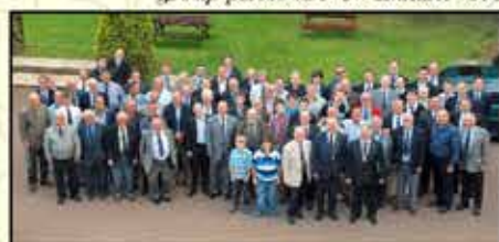
Louis group photo at the New Lanark Triennial Assembly in 2011