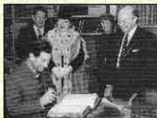
Royal Autographs - Prince Charles signs the Lockit Book when he