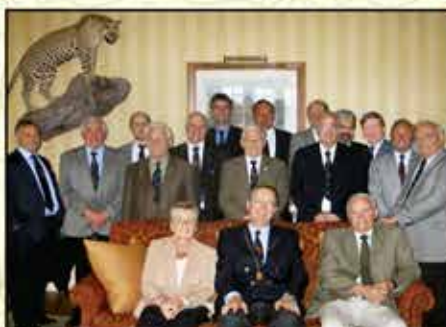
The house cat keeps an eye on the inspection party on their visit to Craigmakerran House