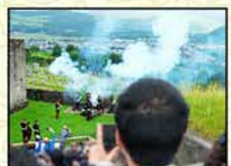
Finally a 21 gun salute just as the Triennial Assembly was leaving Stirling Castle for the Queens official birthday