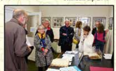
Our first "Doors Open Day" in 2018 was a huge success with over 100 visitors