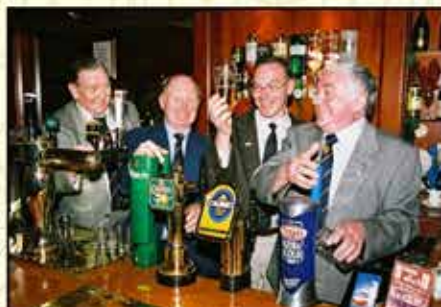
Ale Tasters and Meal Searchers in 2003