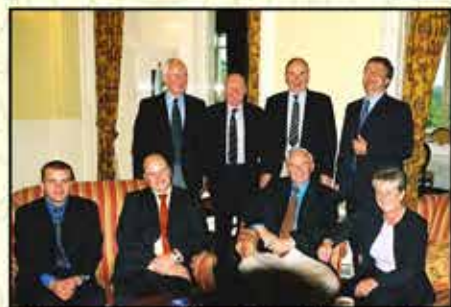
A happy group of our Tenant Farmers after the annual inspection dinner in 2002