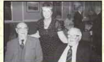
The Millennium Dinner held in March 2,000 at the Station Hotel was attended by over 100 Guildrymen