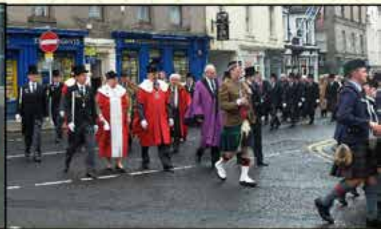
Perth Guildry hosted the Court of Deans of Scotland and they lit up a wet April morning as they paraded through the streets of Perth