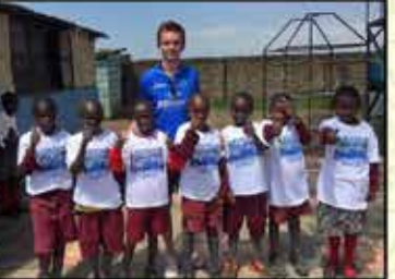
The Guildry supported an assortment of teams with donations to cover the cost of equipment and kit