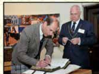
officially opened the A K Bell Library Prince Edward added his signature on a visit to the museum, The Queen and Prince Phillip signed the book on a private visit to Scone Palace