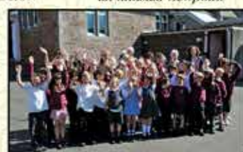
Guildtown School Pupils wave the Inspection Party off in 2010