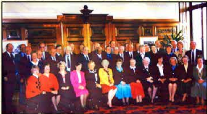
A civic reception was held for the Court of Deans of Scotland when they held their Autumn meeting at Perth in 1997