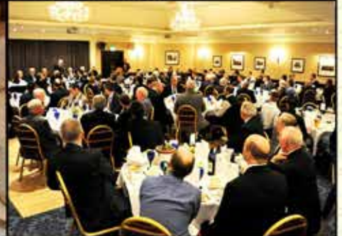
An 800th Anniversary Dinner was held in the Salutation Hotel to celebrate the granting of the Royal Charter by King William the Lion in 1210