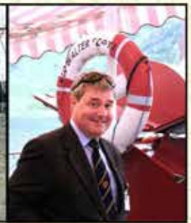
Some favourite Triennial Assemblies - what do you think? - On board the Orient Express Northern Belle - 'Doon the Watter' aboard the 'Waverley' - Kelvingrove Museum - Discovery Point, Dundee and Anstruther - Stirling Castle, a sail on Loch Katrine and Dunblane