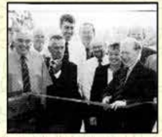
Some of the major donation given as part of the Guildries Millennium celebrations - Stole and Gown for St John's Kirk - Plaques in Tay Street and Guildtown and the Millennium Bridge at Guildtown.