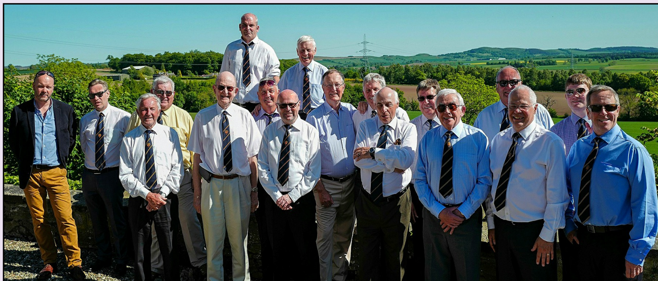
The Inspection Team enjoyed the beautiful sunny day