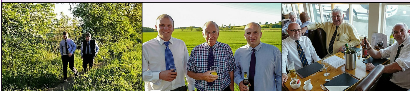
The Dean makes a welcome appearance