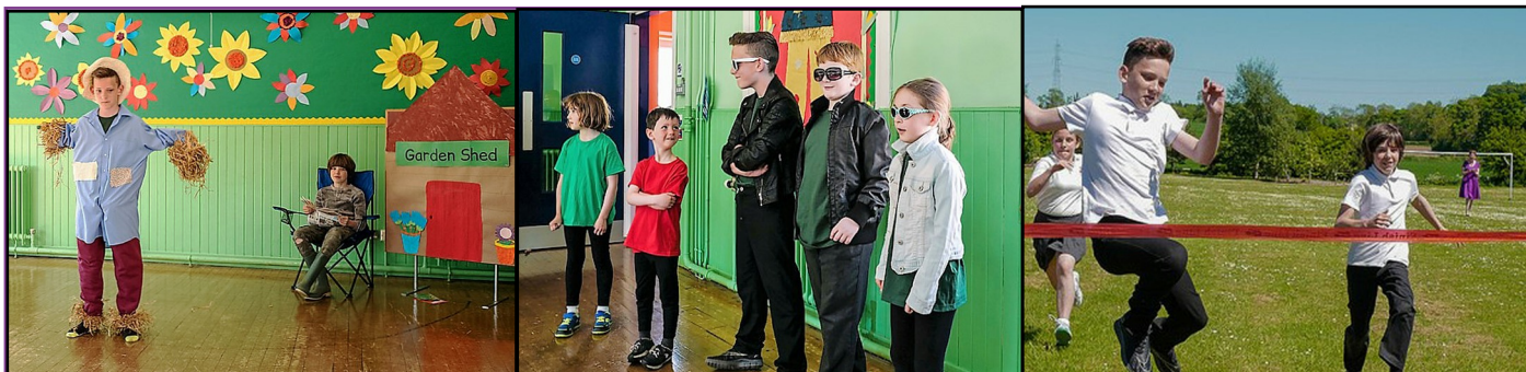
The pupils entertained us to their usual standard